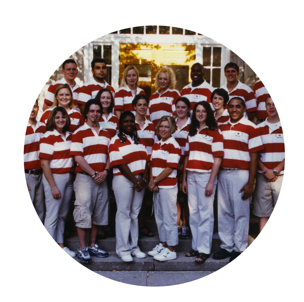
DIFFERENT MAJORS & LEVELS OF INVOLVEMENT