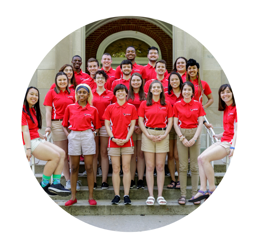
COMMUNICATION SKILLS & TEAMWORK EXPERIENCE