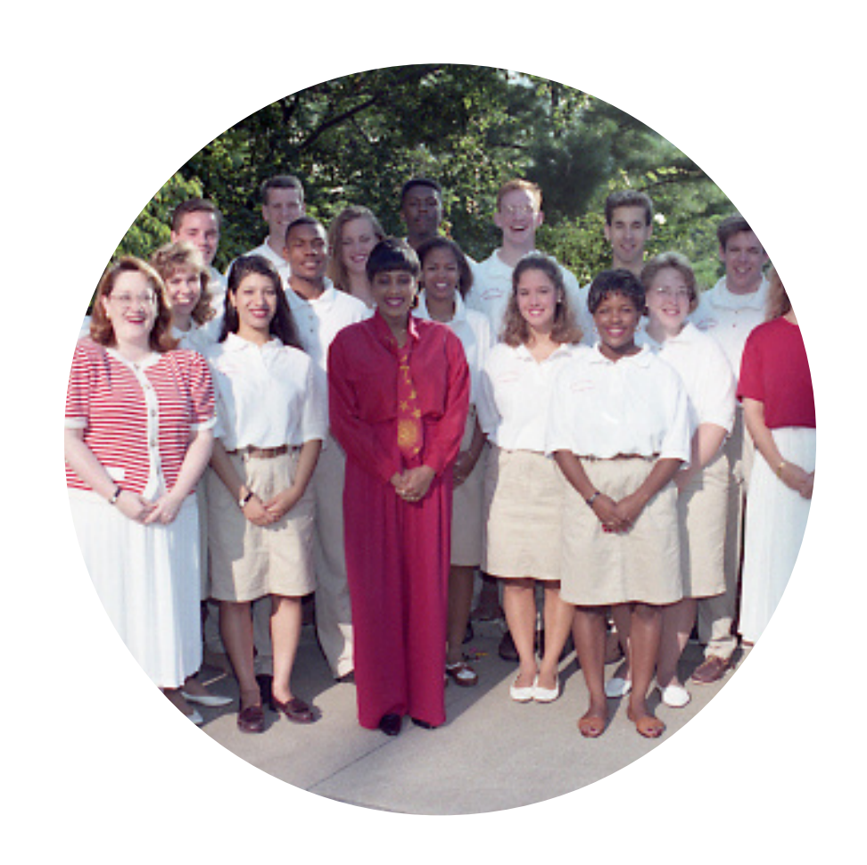
DIVERSE BACKGROUNDS, EXPERIENCES & PERSONALITIES